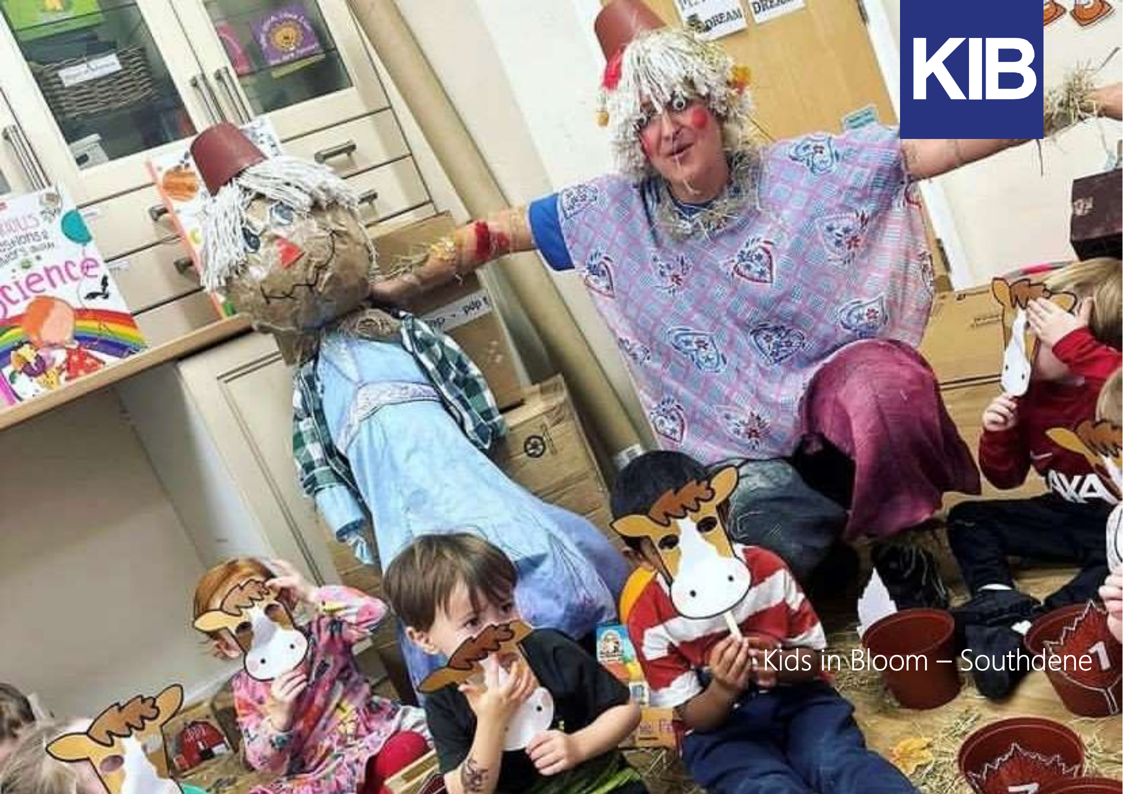
Kids in Bloom – Southdene